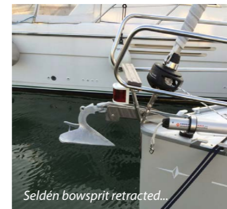
Seldén bowsprit retracted...

Some people do have both a Super Zero and a cruising chute