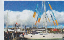
A smaller event may take place at Kip Marina

The official Ports of Entry on the French Channel coast are: Dunkirk, Calais, Boulogne, Dieppe, Le Havre, Honfleur, Caen/Ouistreham, Cherbourg, Carteret, Granville, St Malo, St Brieuc/Légué, and Roscoff.