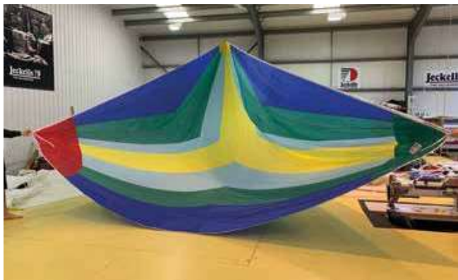
Above, cruising chute ready to be shipped. Below, selecting sailcloth for the laser cutter. Right, materials ready to use and below right, the sewing machine operator sits in a cutout on the loft floor