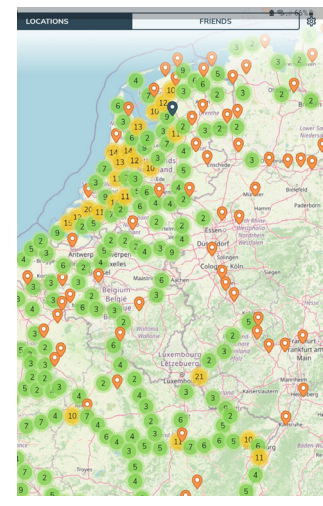
Hundreds of inland waterway locations feature on CAptain's Mate

Last but not least, as an EIWS member you can download free PDF copies of the section's 30 full colour