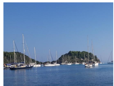
LAKKA BAY ON THE NORTH OF PAXOS

An early clearance with port authorities saw us depart Italy for Greece to Othonoi north of Corfu, anchoring on the south of the island in the sheltered bay off Ammos. Swimming off Othonoi was a unique experience, with the cold currents from the 951 m deep trench less than half a mile offshore delivering at least a 5 degree intermittent temperature change as you swam. Through good planning we had a balance of dining out and cooking on board in the evenings with buffet lunches on the move, all the crew taking their turns to deliver their signature dishes, so catering was healthy and to a very high standard.