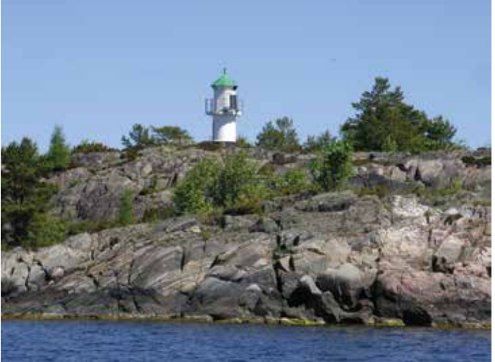
Left, at Åsneviken, moored Swedish-style and cooking on the campfire. Inset, a lovely day's sailing, above, a typical lighthouse, and below, one of many beautiful sunsets...

Here, as at many popular mooring places, the archipelago ( skärgård ) authorities have provided basic facilities consisting of rubbish bins, dry toilets and in this case a camp-fire site plus firewood supply. A recce in the dinghy revealed a good mooring place close to these and we successfully moored there, feeling quite pleased with ourselves. What we call an anchorage is known in Swedish as a naturhamn (natural harbour); this name reflects both the Swedish preference for mooring to the shore and the good shelter and/or facilities to be found in many of them. It was still low season, so we had this lovely spot to ourselves for the next four days; we enjoyed camp-fire barbecues, walks on waymarked routes through the forest, and relaxing with our books, as well as doing little maintenance tasks on the boat.