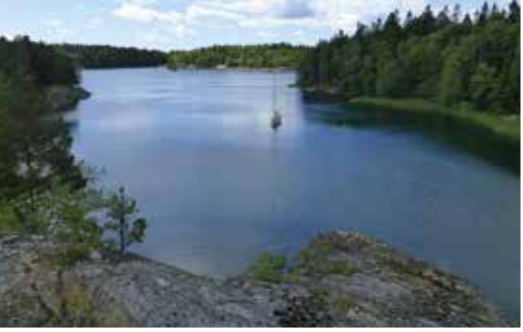
Above, squeezing through the tiny Dragets canal was worth it to get to the secluded lagoon, left

we were lucky enough to have one of the permits that year. We were very glad we visited this place; it has a visitor centre and lovely walks in meadows, woods and on islands connected by little pedestrian suspension bridges; the weather was good and we thoroughly enjoyed strolling around, finishing the day with another barbecue on one of the provided camp-fire-places.