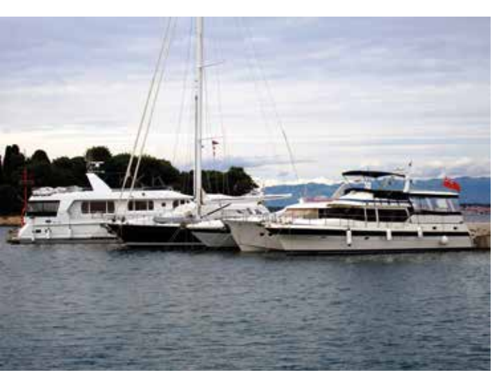
The new tax would be potentially prohibitive, with craft such as these between 15m and 20m paying Kn9,600 (more than £1143) per year on top of mooring fees and the Croatian cruising permit.

The CA's protest over a proposed 400% increase in Croatian Sojourn Tax on boat owners has led to a proposed delay in implementation and a planned review of the best solutions.