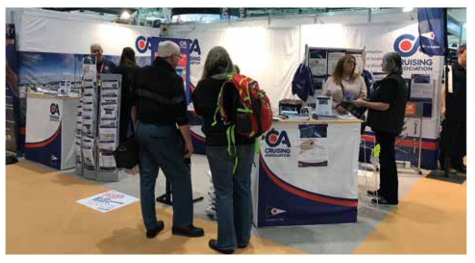
The five-day London Boat Show was a CA success, with 38 new members on just one day

Meanwhile, a big thank you to everyone who has already signed the fishing gear petition and persuaded their friends to do likewise, especially those who promoted the cause through their local clubs, section meetings and social media platforms. We have the cruising world talking!